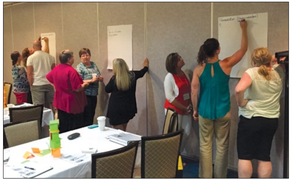
NSTU members attending NSTU's Leadership Institute learn about teacher and student aspirations.

Fun and Excitement is the fourth condition in support of teacher and student aspiration. This condition supports the engagement and interest in one's work. If we find teaching and learning enjoyable, we will be more apt to engage actively, contribute more and be more effective. How do we support fun and excitement