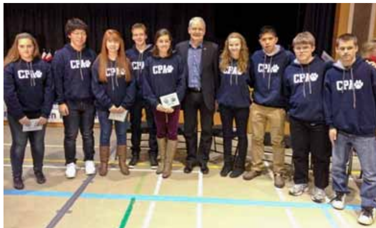
Marc Garneau with CPA students.